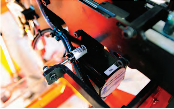
Using ACE hydraulic brake cylinders instead of rubber buffers optimized the machine's performance.

The designers decided to switch out the rubber buffers for hydraulic brake cylinders from ACE Controls to prevent the rebound effect from happening. The movement of the wheel-truing machine could therefore be better controlled, resulting in more precise gripping of the spokes.