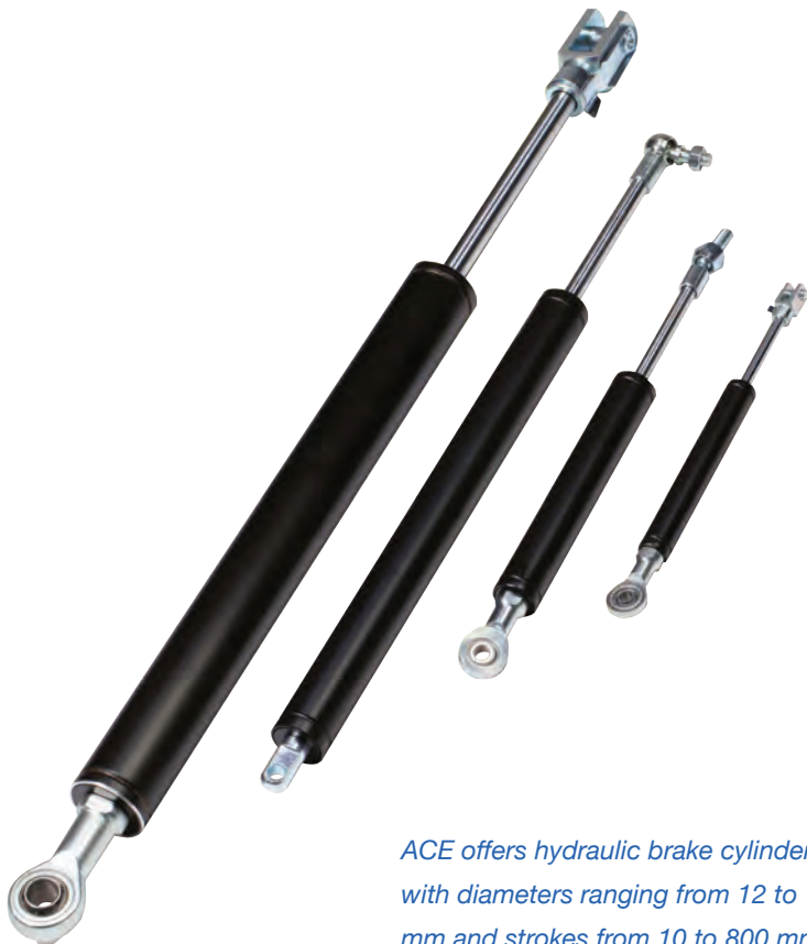
ACE offers hydraulic brake cylinders with diameters ranging from 12 to 70 mm and strokes from 10 to 800 mm.

The designers decided to switch out the rubber buffers for hydraulic brake cylinders from ACE Controls to prevent the rebound effect from happening. The movement of the wheel-truing machine could therefore be better controlled, resulting in more precise gripping of the spokes.