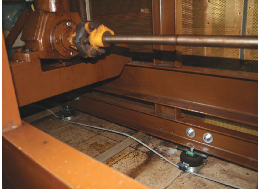
Libeert chose ACE Controls leveling mounts to isolate vibrations in its chocolate manufacturing.

Since the system weighs about 4,000 pounds, they had to find the right vibrating unit stand for this machine. With a maximum load of 297 pounds per air spring element, the