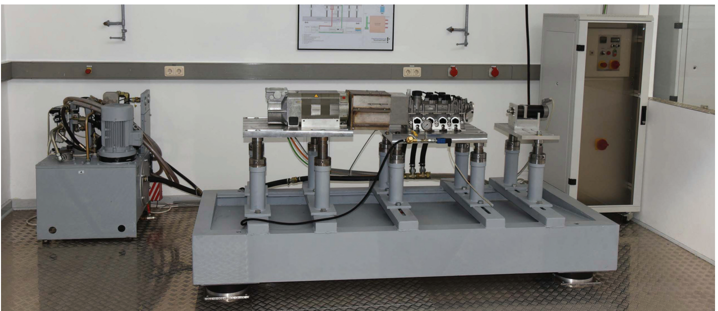
Equipment on the test bench, such as an electric motor, caused the entire bench to vibrate.

According to Sebastian Schuette, a research assistant in the university's automotive program, the key to making drives more efficient lies in the engine's oil pump—by reducing flow rate, then it is also possible to reduce power consumption. For their research, the students analyzed the hydraulic, volumetric and mechanical characteristics of various oil pumps to see how they could improve flow behavior—particularly, how to avoid leakage and reduce friction, for example. The students also assessed the efficiency of each pump's control strategy.