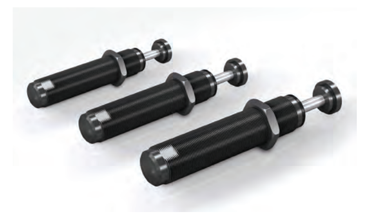
ACE miniature shock absorbers (type SC650EUM-0) feature a long stroke and can be fitted with a linear or progressive brake curve.

Actuator Sensor technology (LRAS). "These components work by dampening the impact during a crash, ensuring the system doesn't get damaged."